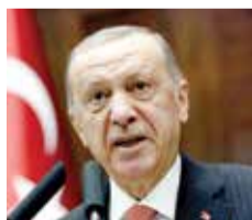
Turkish President Recep Tayyip Erdogan addresses his party's group meeting at the Turkish Grand National Assembly in Ankara, Turkey, on November 23, 2022.

Turkey said Wednesday it was more determined than ever to secure its Syrian border from attacks by Kurdish forces, threatening a ground operation "at the most convenient time." Ankara launched an air strikes campaign across Iraq and Syria on Sunday as part of Operation Claw-Sword following a bombing in Istanbul on November 13 that killed six people. "Our operations with planes, cannons and drones are only the beginning. Our determination to secure all our southern border... with a safe zone is stronger today than ever before," President Recep Tayyip Erdogan told lawmakers in parliament. "While we press ahead with air raids uninterrupted, we will crack down on terrorists also by land at the most convenient time for us," he told lawmakers from his AKP party. Turkey blamed the Istanbul attack on the Kurdistan Workers' Party (PKK), which is blacklisted as a terror group by the European Union and the United States. The PKK, which has waged an insurgency against the Turkish state since 1984, denied any role in the bombing. Turkey has intensified air raids and artillery fire on the PKK and the Kurdish People's Protection Units (YPG) targets in northern Iraq and Syria.