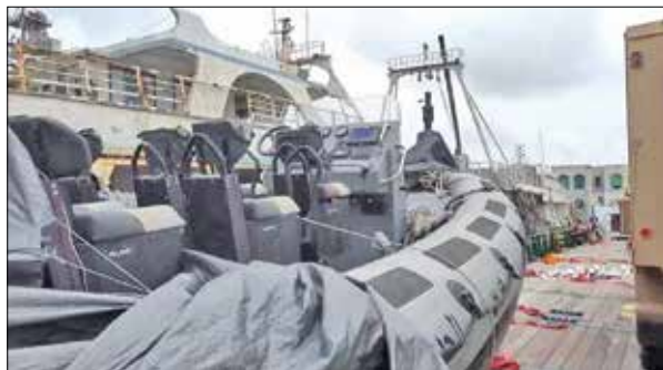
This picture, provided by the media bureau of Yemen's Operations Command Center on January 3, 2022, shows military equipment aboard a United Arab Emirates-flagged military cargo vessel seized by Yemeni naval forces.

Brigadier General Yahya Saree stated that the Yemeni forces and their allies