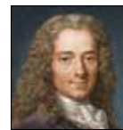
Voltaire (French writer)

One merit of poetry few persons will deny: It says more and in fewer words than prose.