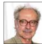
Jean-Luc Godard (French-Swiss director)

Cinema is not a series of abstract ideas, but rather the phrasing of moments.