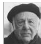
Paul Strand (American photographer)

The artist's world is limitless. It can be found anywhere, far from where he lives or a few feet away. It is always on his doorstep.