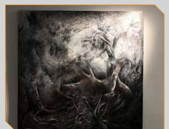
An exhibition titled 'Illusions of Time,' featuring the works by Navid Mirzaei, is underway at Tehran's Negar Gallery until September 21, 2021.