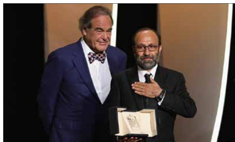
Iran's Asghar Farhadi (R) is pictured alongside American filmmaker Oliver Stone after winning the Grand Prix award at Cannes Film Festival in Cannes, France, on July 17, 2021.