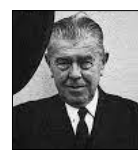
Rene Magritte (Belgian artist)

Art evokes the mystery without which the world would not exist.